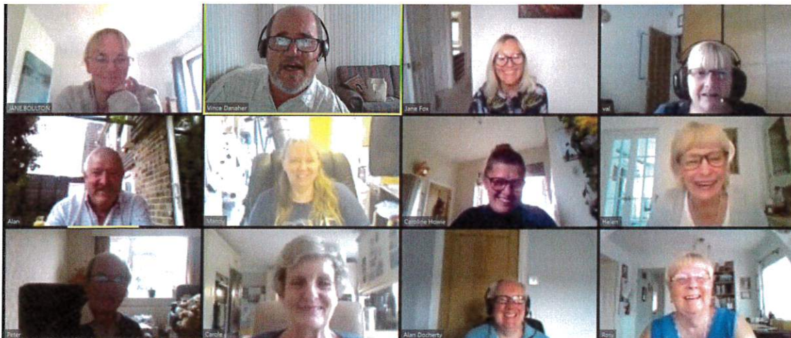
Virtual carer café

Face-to-face carer clinics and cafes ceased at the end of March 2020 and virtual Talk and Support and groups led by Community Connectors started. By July, we were offering two online cafes and groups a week, many with guest speakers, and the number of carers attending these had increased almost sixfold by the end of this year.