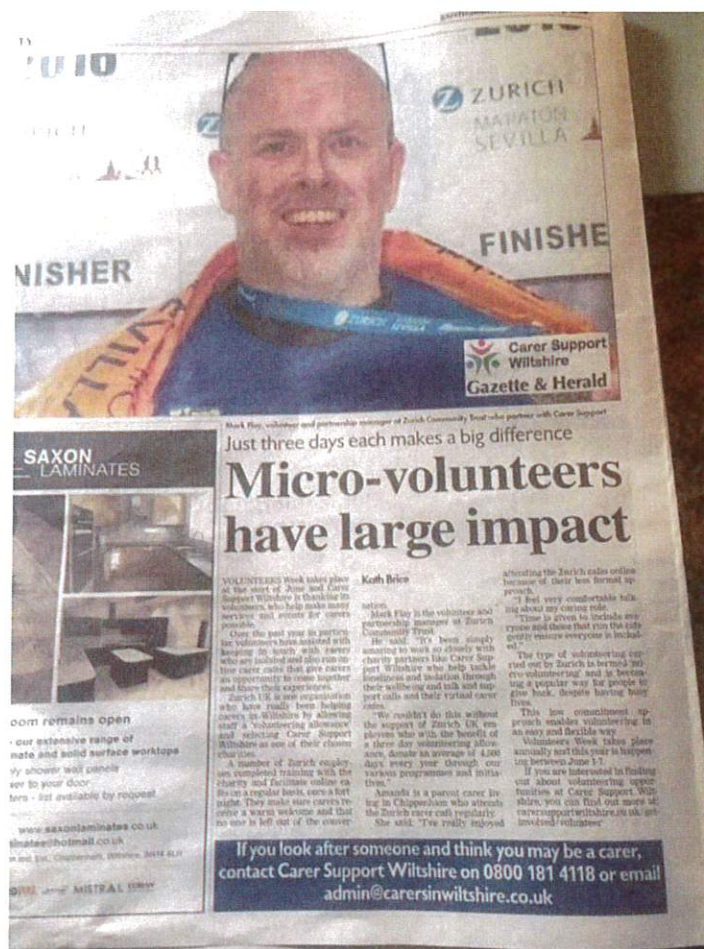
One of CSW's monthly news stories in the Gazette & Herald

Know the priorities which matter to carers - Wiltshire Carers Forum (was Wiltshire Carer Involvement Group) has become well established. We have continued participating at Wiltshire Carers Action Group (a forum for service providers who support carers).