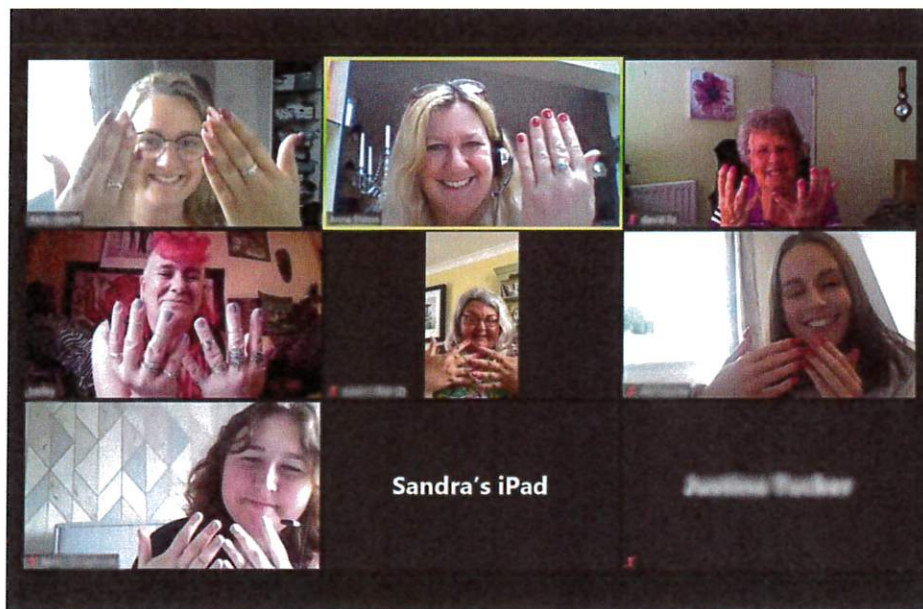
Carer Support Dorset pampering session for carers